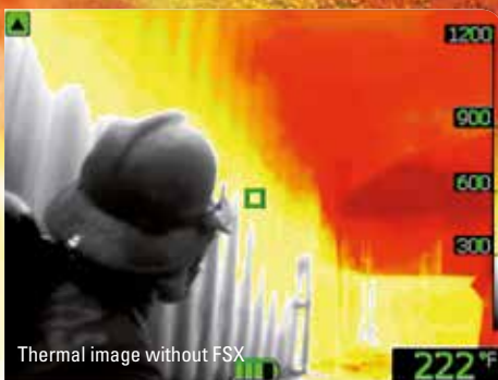
Thermal image without FSX