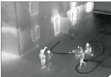
KF6 provides high angle thermal perspective.