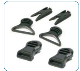
Goggle Swivel Clips