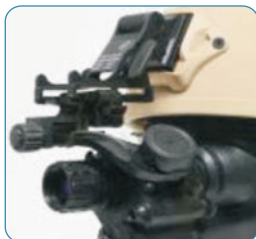
US Army Mount